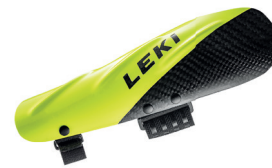
Fore Arm Cut Protector