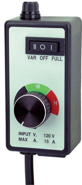
Example speed controller

A continuous water flow is critical. Using "wet" blades without water, even for a few seconds, causes excessive heat and blade damage, and creates a safety hazard. Check the saw or tool carefully before using a wet cutting diamond blade. Make sure it is safe to use the saw or tool with water.