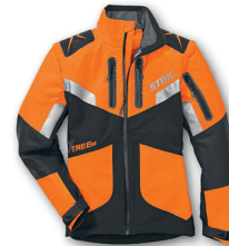
Chest Body Armoured Jacket by Stihl with cut protection