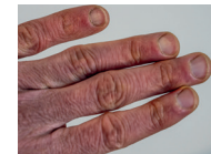
The skin turns red as blood flow returns.