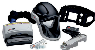
Full face, head, visor, dust mask with Powered Respirator air filters combined (not goggles or safety spectacles) 20V0066 3M VersaFlo Powered Respirator Starter Kit