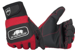
Hi specification Anti vibration anti cut gloves.

Here is a list of adequate PPE clothing examples you should consider when using these products. These are minimum recommended protections: Class 1 230mm 9" level 5 Class 2 125mm 5" level 4